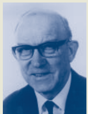
Sir James Wicks: Wanganui Computer Centre Privacy Commissioner from 1978 to 1983.