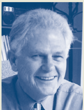
Bruce Slane: Originally appointed under the Privacy Commissioner Act 1991 and the first Privacy Commissioner to serve under the Privacy Act 1993.